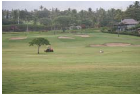
Golf course in Hawaii, location of turf PMSP workshop in May.

Non-Rangeland Forages (Excluding Alfalfa) in the Western States: Posted on the national website in late September.