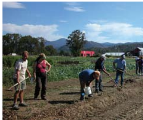
A group of neighboring farmers helps to install a beetle bank at Whistling Duck Farm, in southern Oregon, at a Farmscaping for Beneficials Program farm walk.

The buzz words of biodiversity and conservation now permeate the IPM literature and have been woven into farm support programs of the Natural Resources Conservation Service (NRCS) and into certification programs, including the National Organic Program. So, where does a producer go for science-based information and support for conservation biological control (CBC) and pollinator enhancement? In many states in the western region, research and extension faculty, crop consultants, and non-profit organizations have specialized expertise and knowledge to offer, but this is spread thinly across our vast region, leaving some large areas