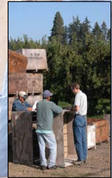
Follow-up evaluation with trainees

To assess changes in handler knowledge and behavior from their employer's perspective, a telephone survey of the producer-employers was conducted seven months post-training. Among survey respondents, 100% replied affirmatively* when asked if following the training, the trainee(s) they sponsored: