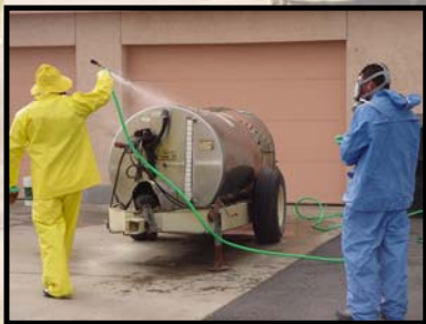
Clean up module